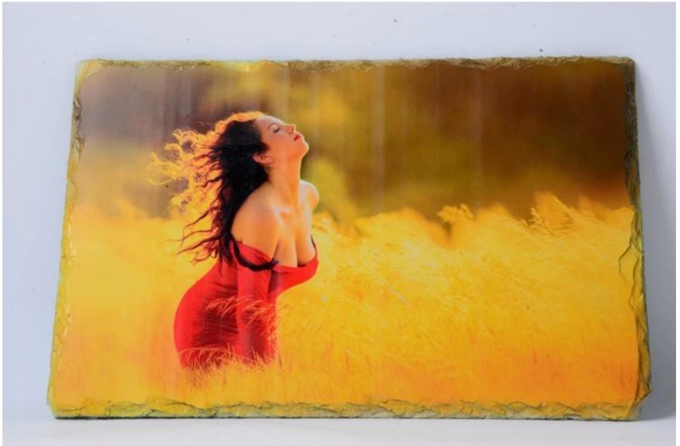
Photo Slate for UV Printing