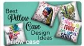
Best Pillow Case Design Ideas Pillow case