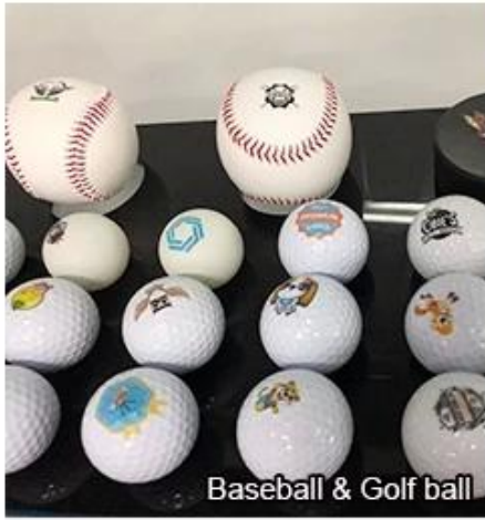
Baseball & Golf ball