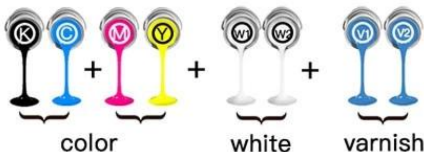
EPSON DX5 Print Heads Arrangement (1pc Head) UV4060/UV6090/N4060/N6090: Single Head 8 Channels