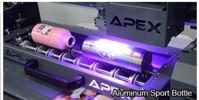
Aluminum Sport Bottle