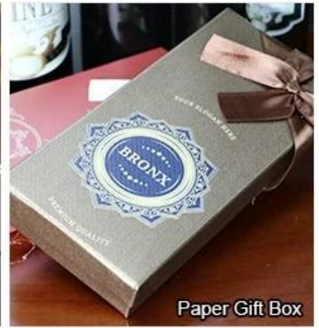
Paper Gift Box